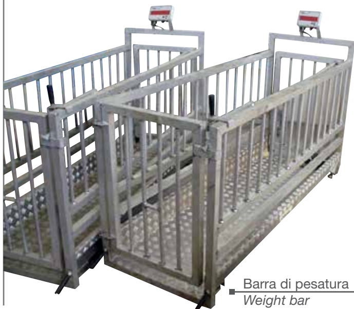
Barra di pesatura Weight bar